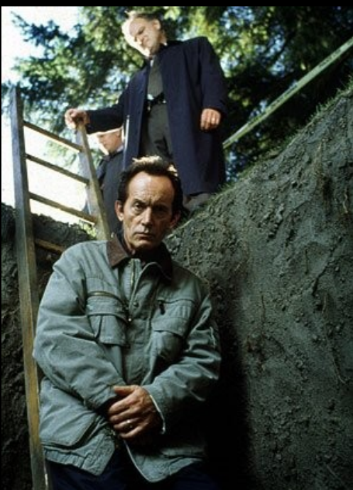
Frank Black and Millennium

All believe that Frank Black and his world have a place in the entertainment of today.